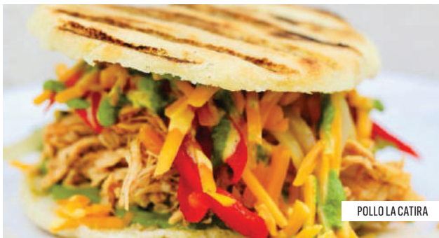
POLLO LA CATIRA

Arepas are grilled patties made with 100% cornmeal flour. We slice them in half and stuff them with fresh organic goodness. We use grass-fed beef and support our local Georgia farms! Arepas are served with fresh cilantro sauce (UNLESS OTHERWISE REQUESTED)